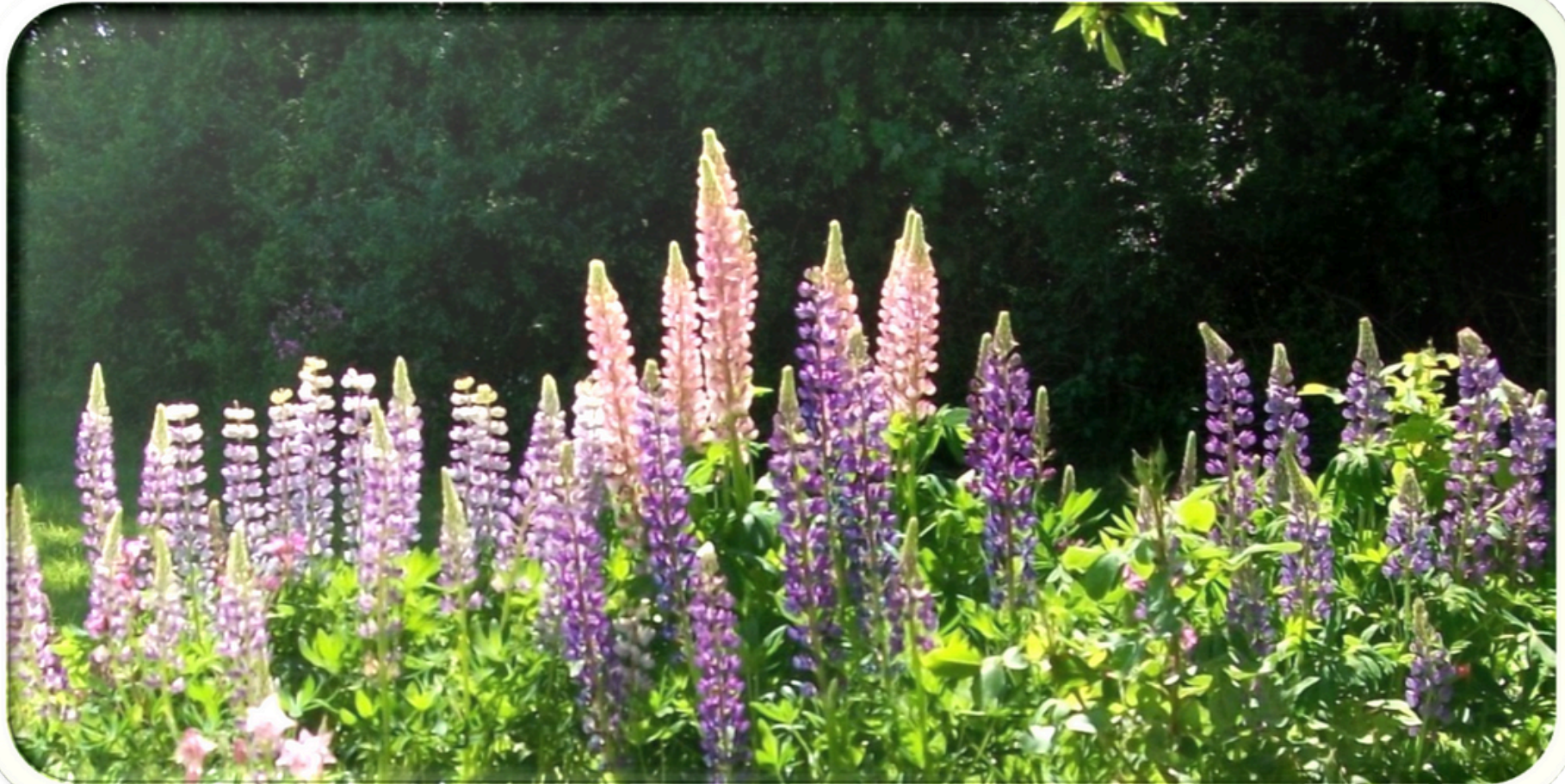
Russell Lupins. (Orbec, France.)

And the words echo, echo on and on from us to us to us, Not forgetting the flowers, with their special beauty and magical powers.