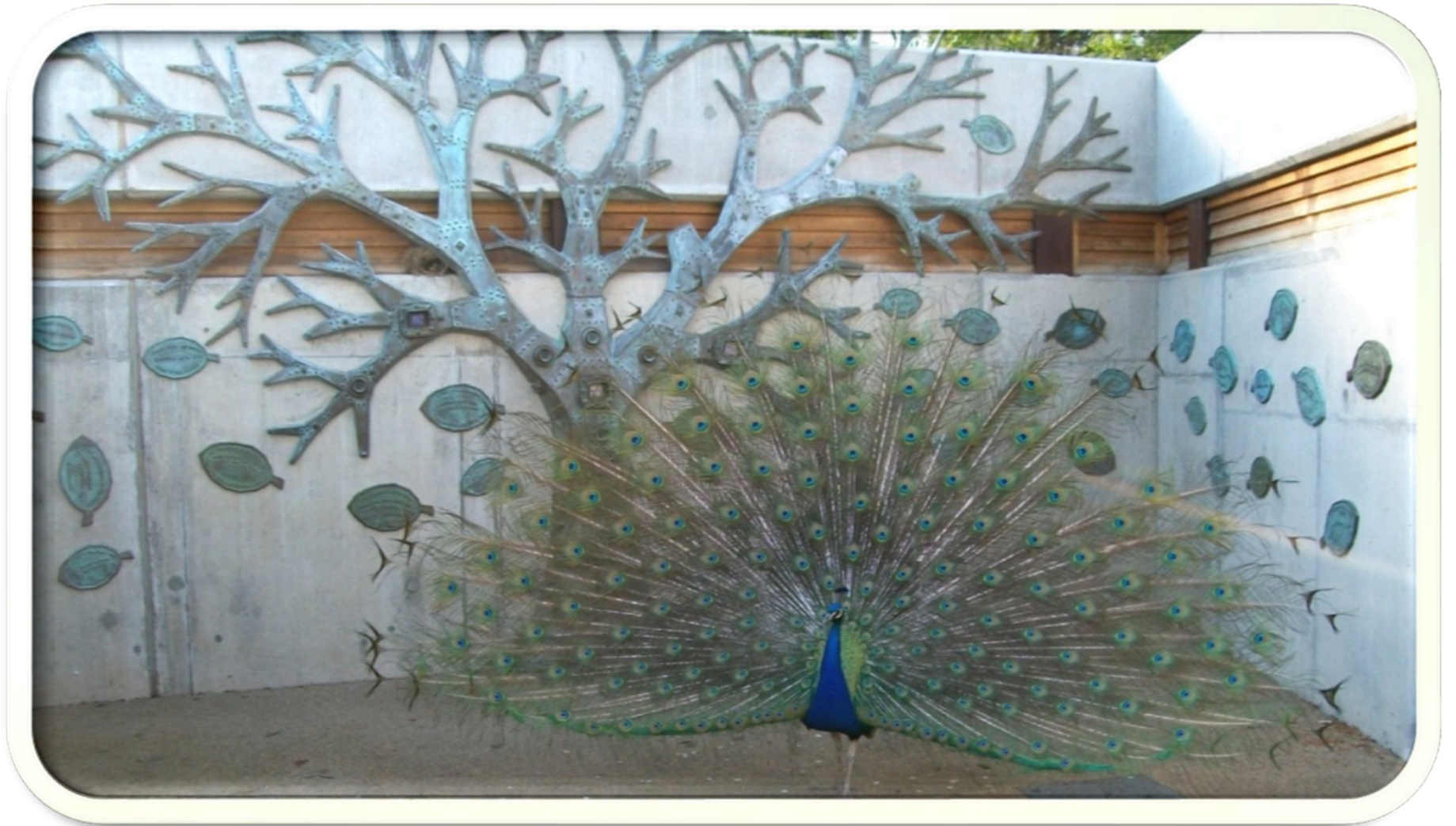
Indian Peacock. (Kew Gardens, London, photography by PEL

Now the Echo is carried by the common little pigeons To the strange Land of love and fast and colourful religions.