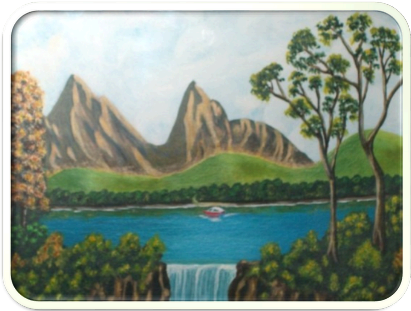
Peaceful Lake. Oil. Painting by PEL.