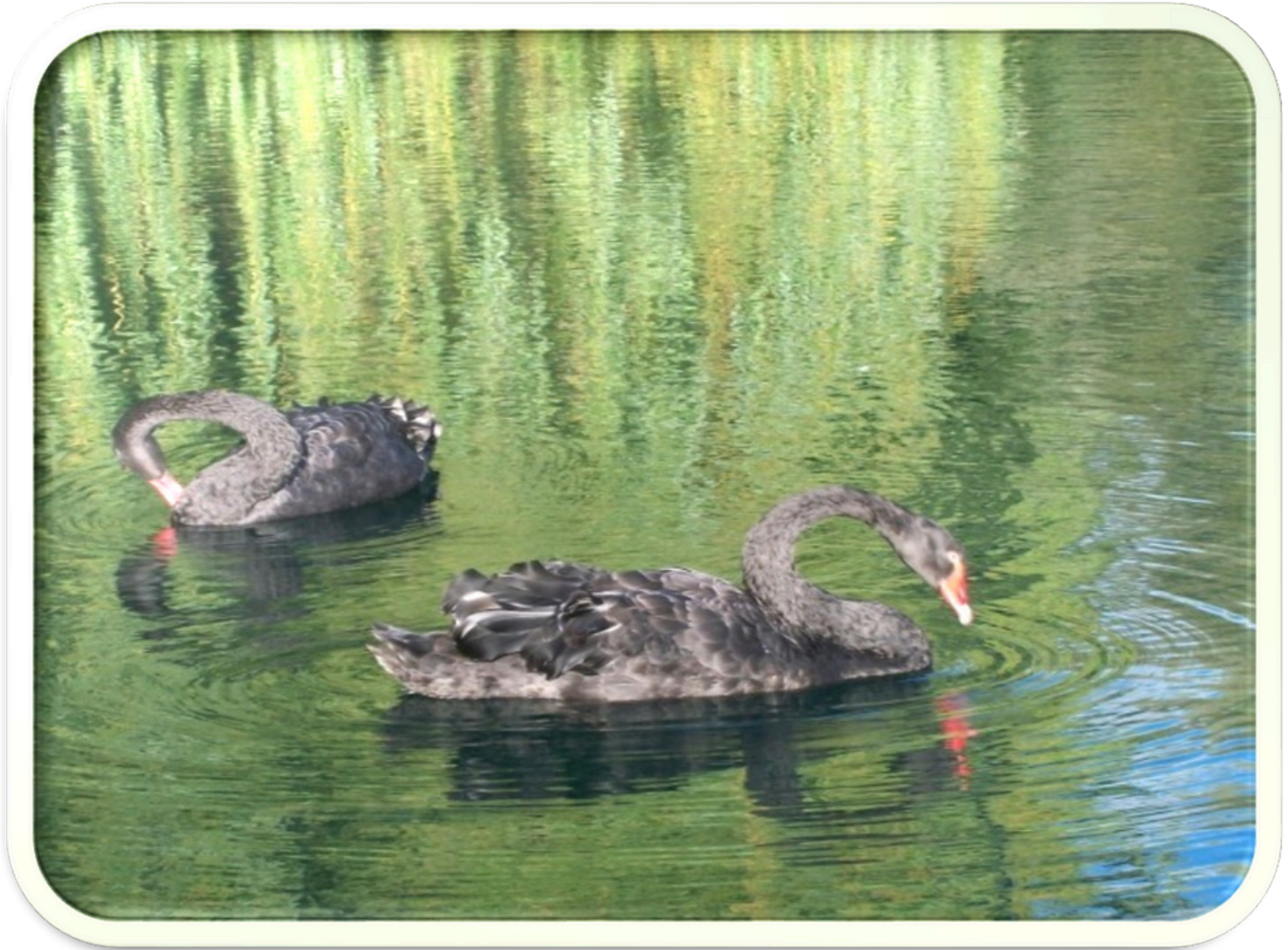
Naturehood. (France.)