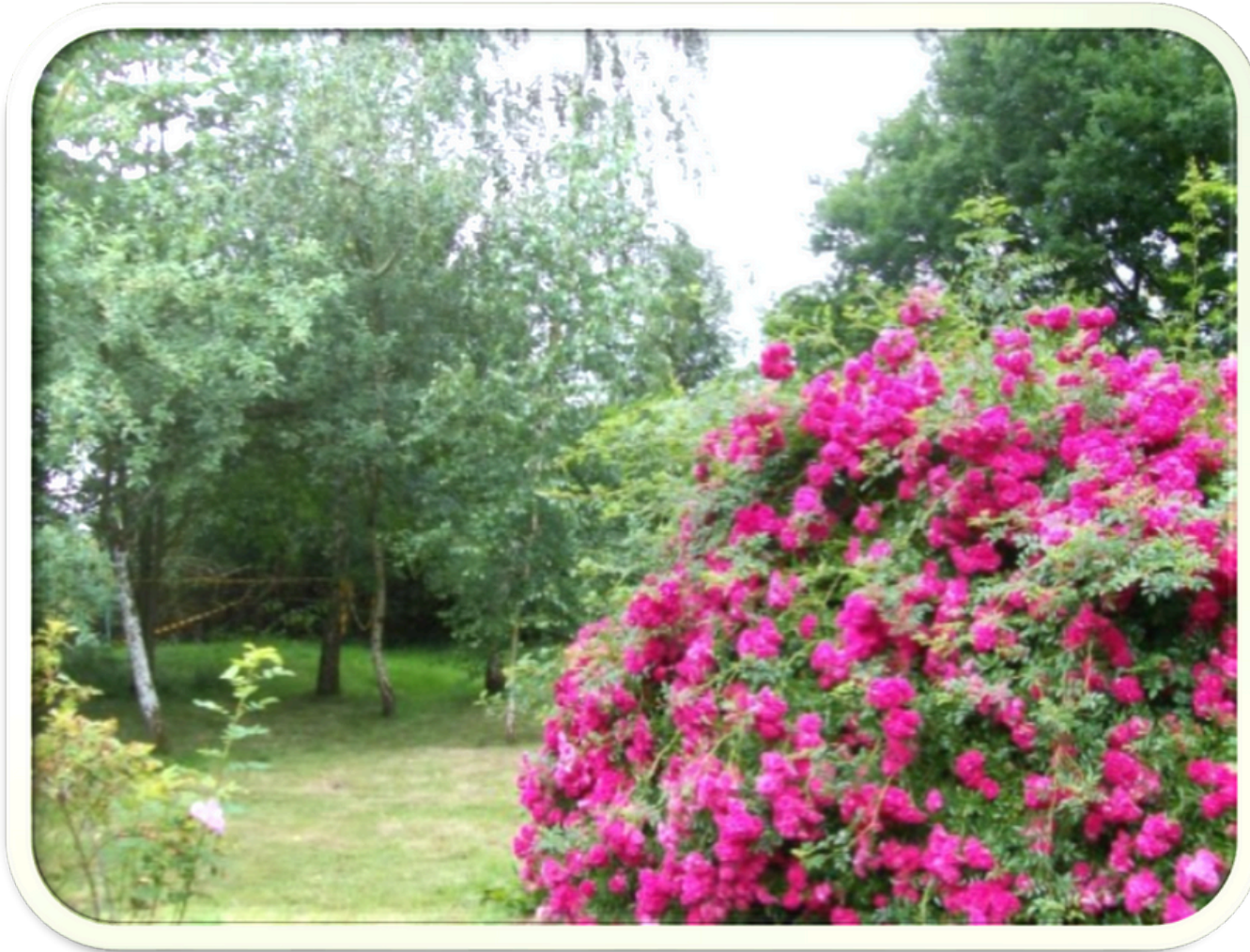
Nature's Abundance. (Orbec, France.)