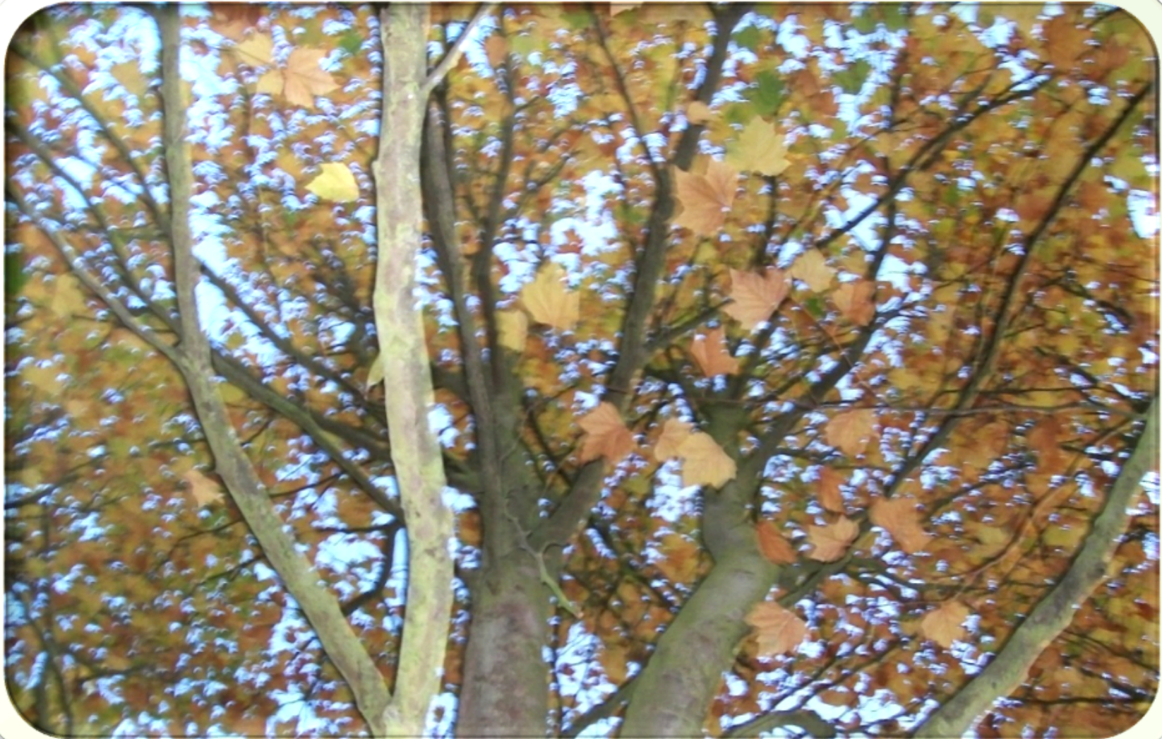
Autumn Leaves. (Gunnensbury Park, London, UK.)

Now the Echo is carried by the butterflies and breeze, Through the gardens of the golden, red and orange maple leaves