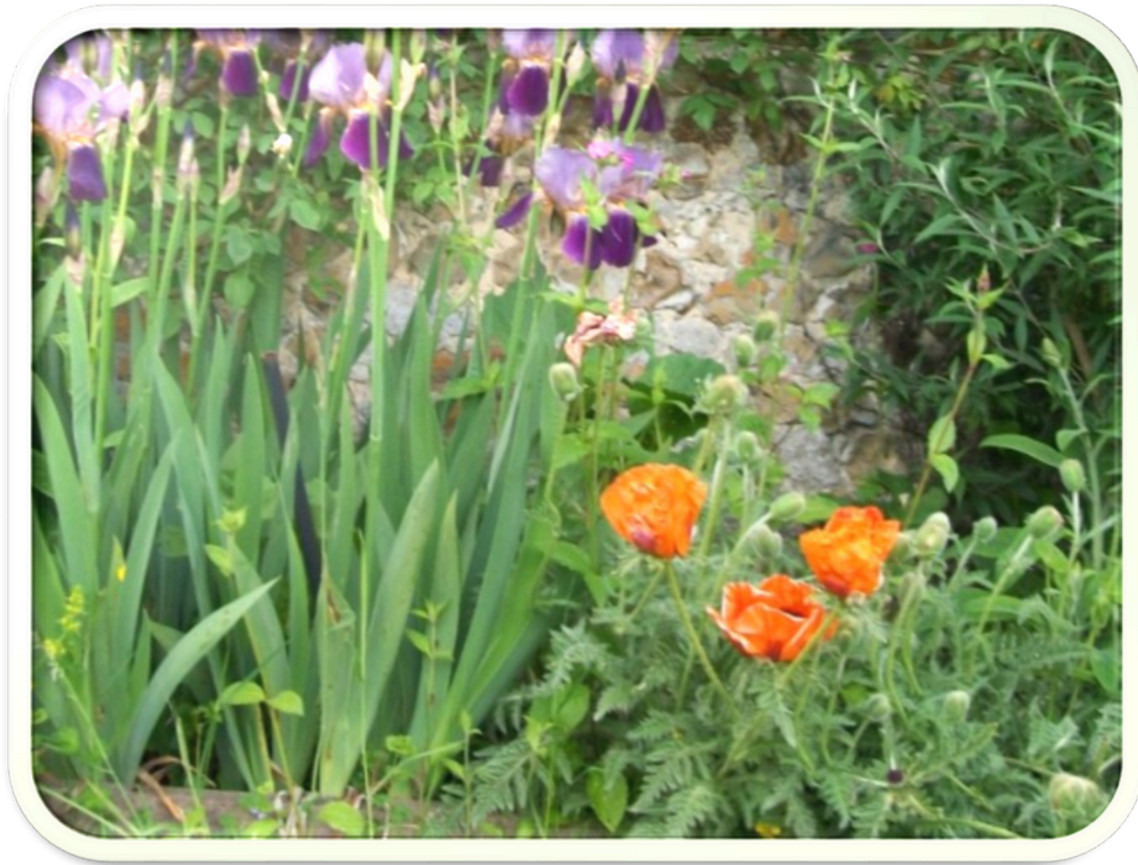
Nature's Colours. (Orbec, France.)