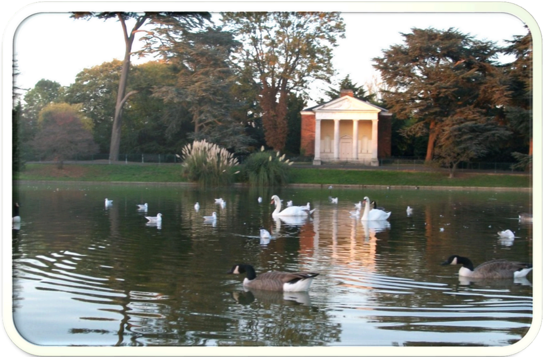
Geese, Swans & Ducks. (Gunnersbury Park, London, United Kingdom.)

Nature Speaks is a celebration of the Natural World.