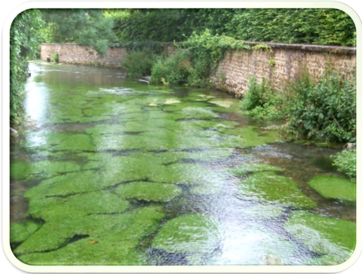
Bernay Stream. (Bernay, France.)