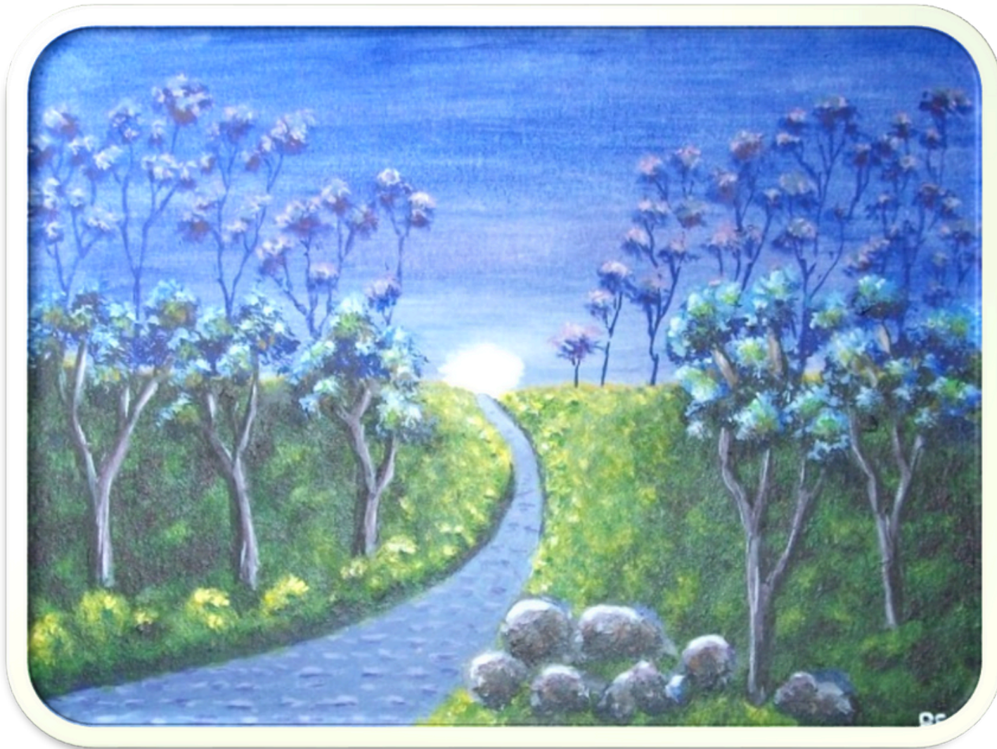
Moonlight. Oil. painting by PEL.

"The Aquarian comes a-riding, through the mists of Time. The Aquarian comes a-riding, striding once again."