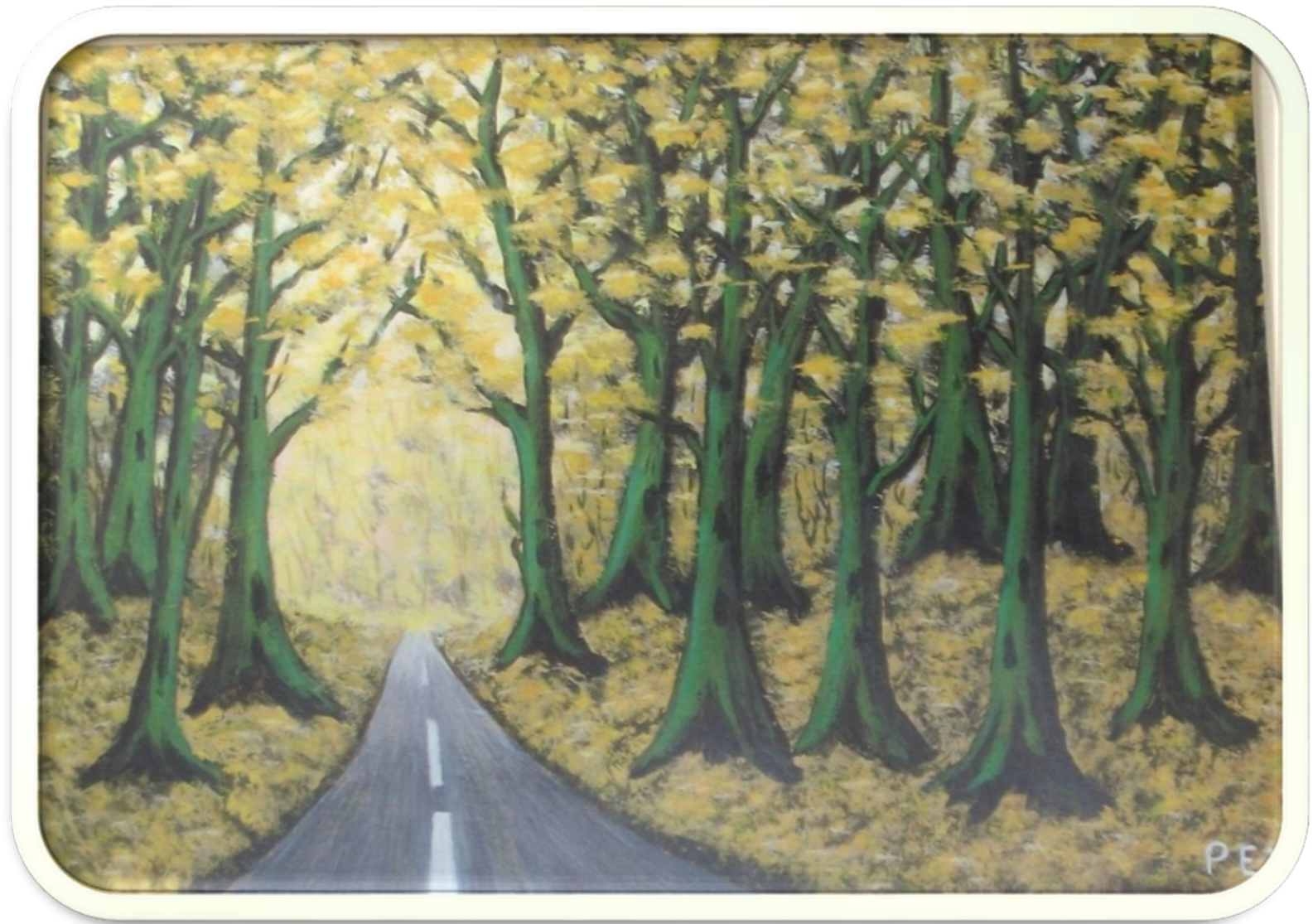
Forest Road. Acrylic, painting by PEL

The Echo is now tenderly picked up again, By our red and golden leaves and sent rustling and bustling, Through our beautiful Canadian autumn trees.