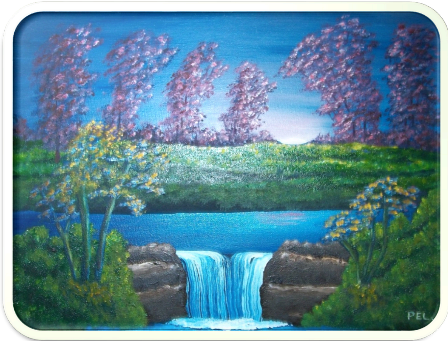
Moonscape. Oil, painting by PEL.

The Echo passes by the God's prayer wheels and chimes, In harmony with the cold waterfalls, splashing their eternal rhymes.