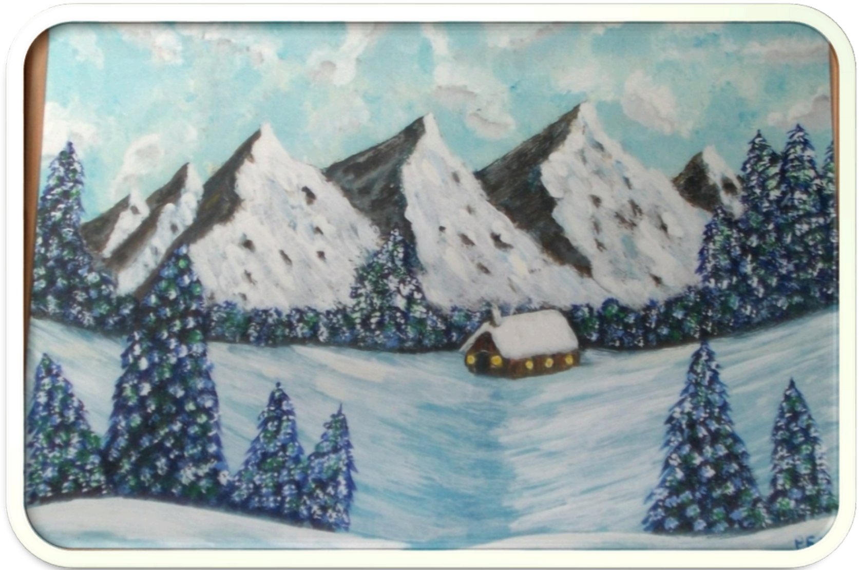
Winter Cottage. Oil, painting by PEL

Now She places the Echo inside a small white box And gives it carefully to our little White Fox, Who carries it safely over our carpet of snow.