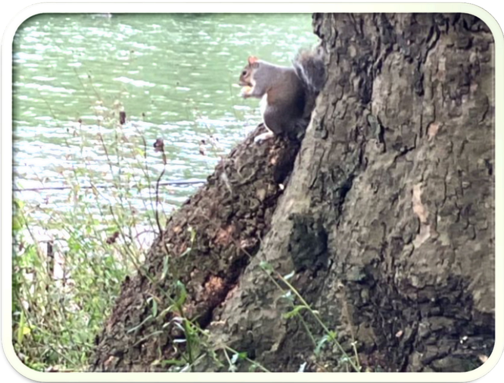
MEG. Squirrel in Saint James's Park. (Saint James's Park, London, United Kingdom.)