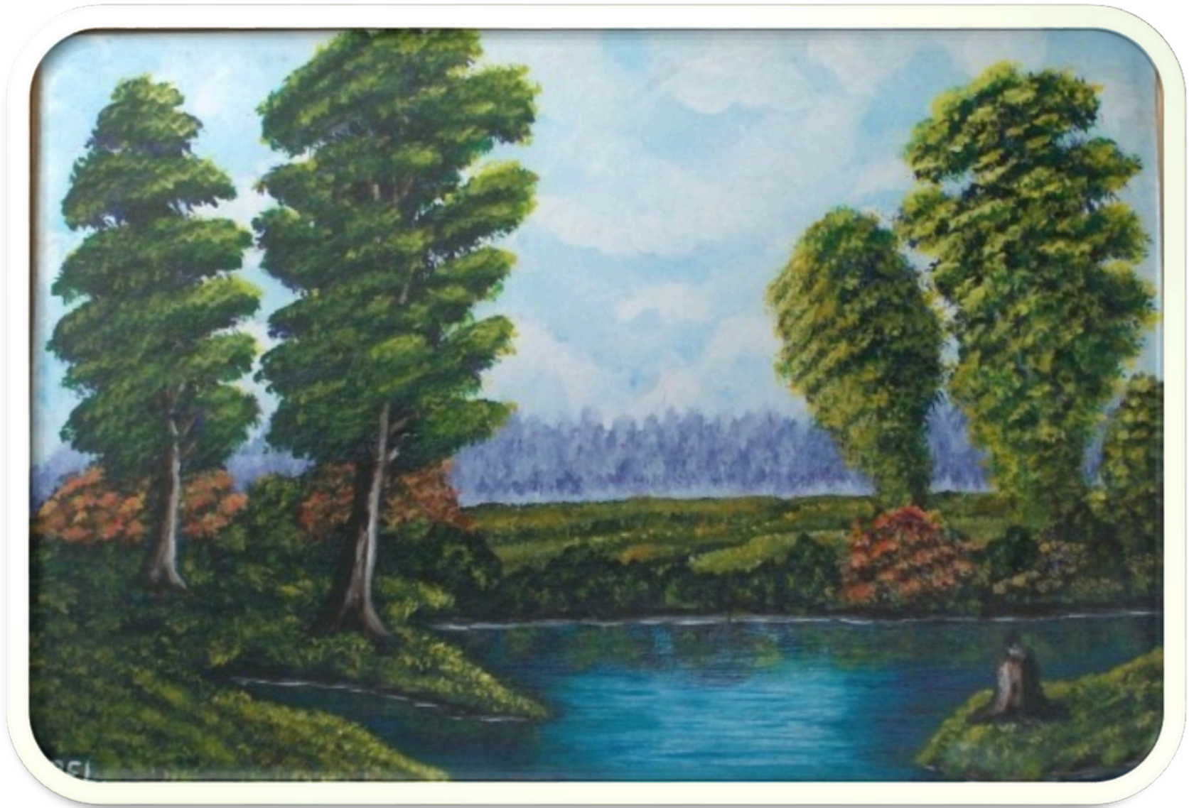
Still Waters. Acrylic, Painting by PEL.

So Hush, little babies just say the Word.