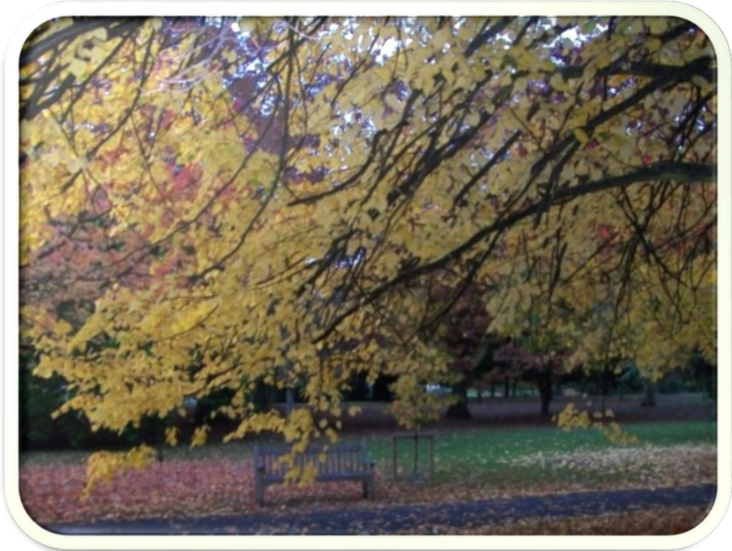
Nature's Art. (Gunnensbury Park, London)