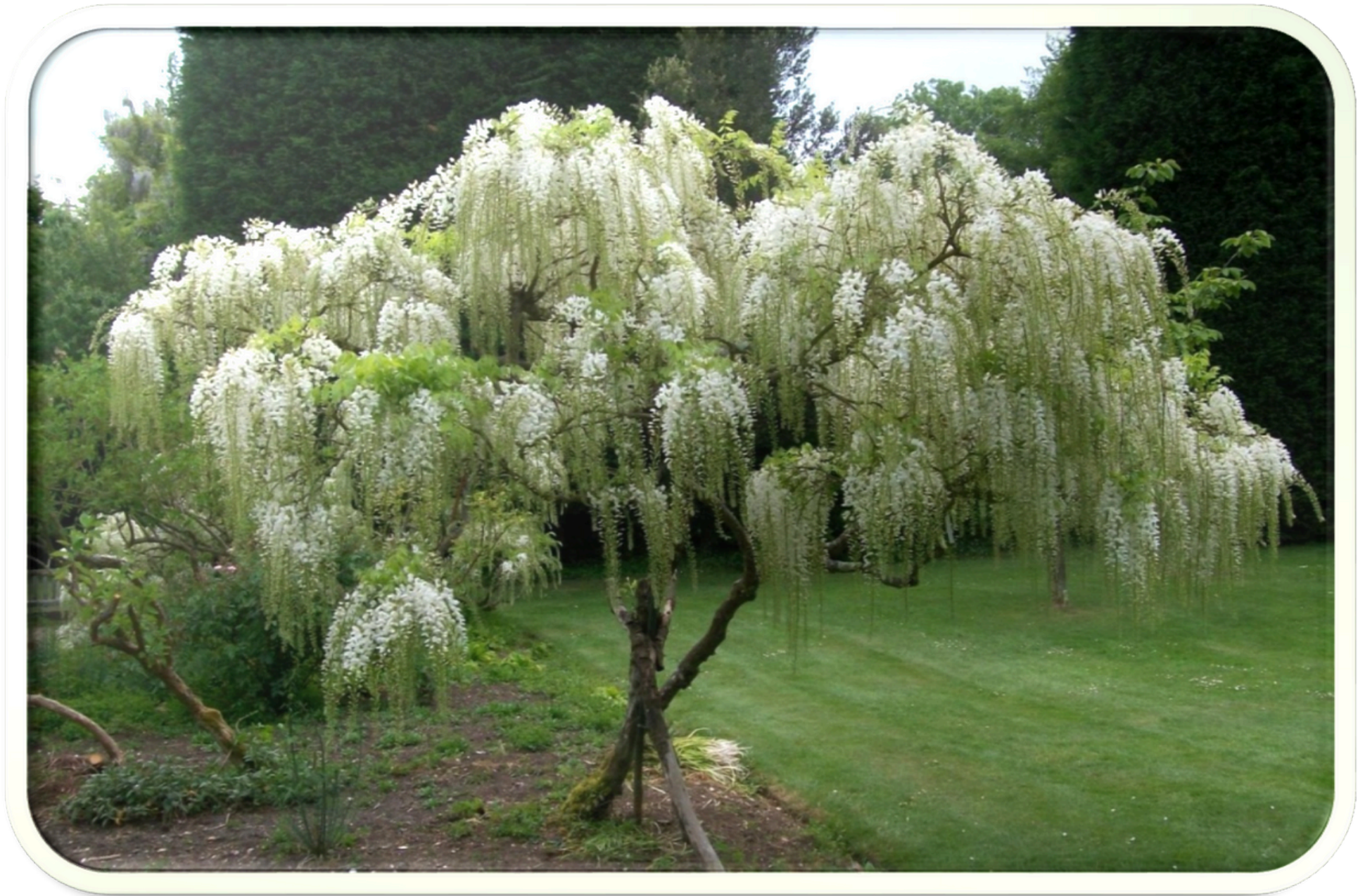
White Wisteria. (Orbec, France.)