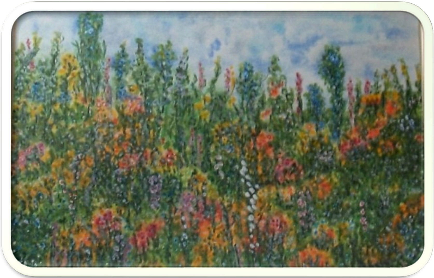
Spring Flowers. (Worcester, United Kingdom.) Acrylic, painting by PEL.

And when our wars break out with a big boom Our spring flowers will still bloom.