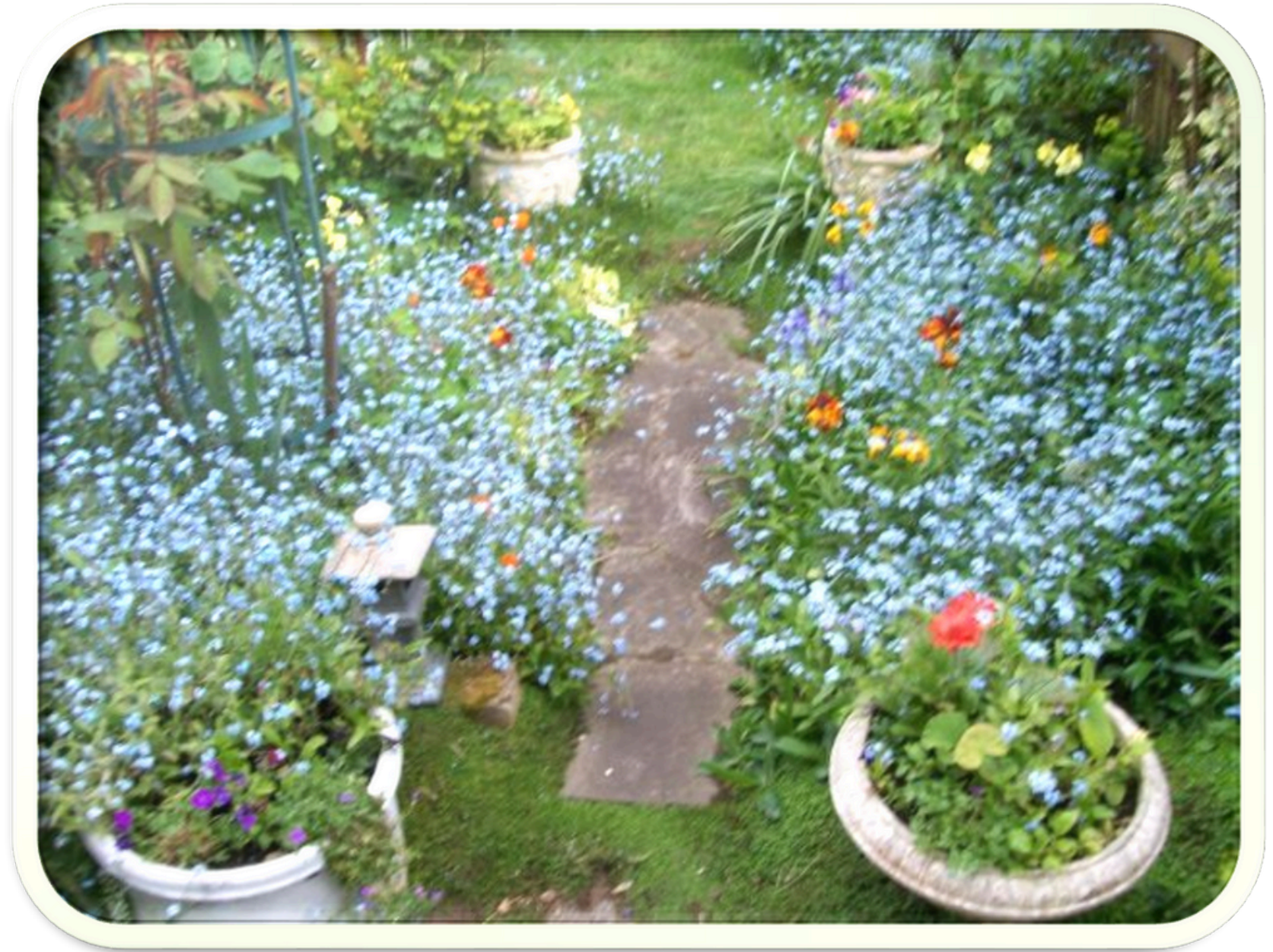
PEL. Forget-Us-Not . (London, United Kingdom.)