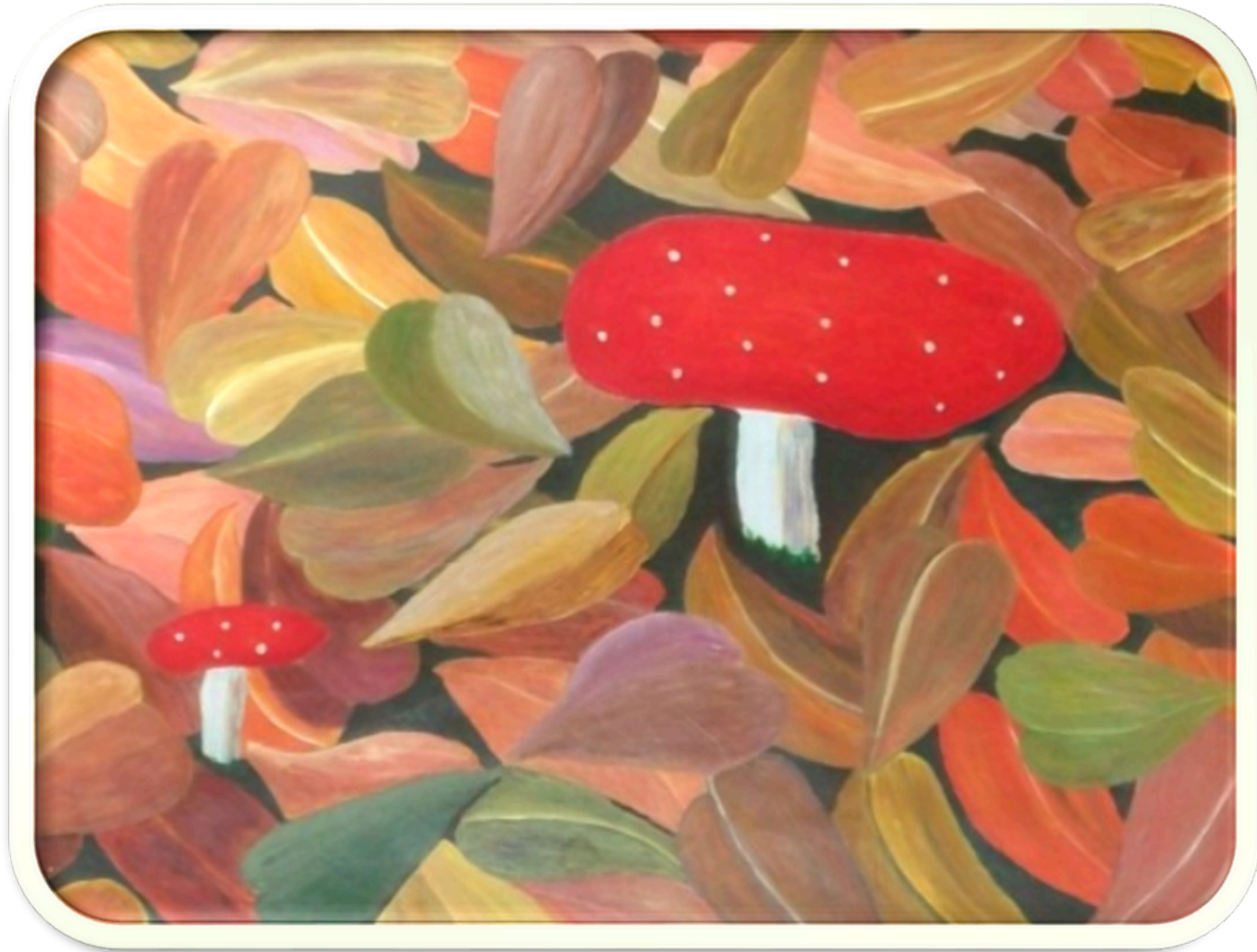
Autumn Leaves. Acrylic. Painting by PEL.