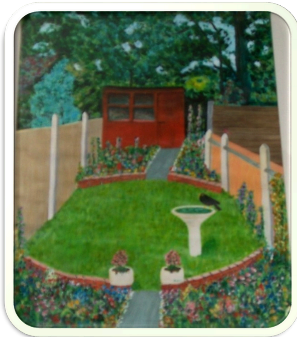
A Word from a Bird. (London garden) Acrylic painting by PEL.

We may find we might even fly like a bird, After all it's only one colour, one note, one word.