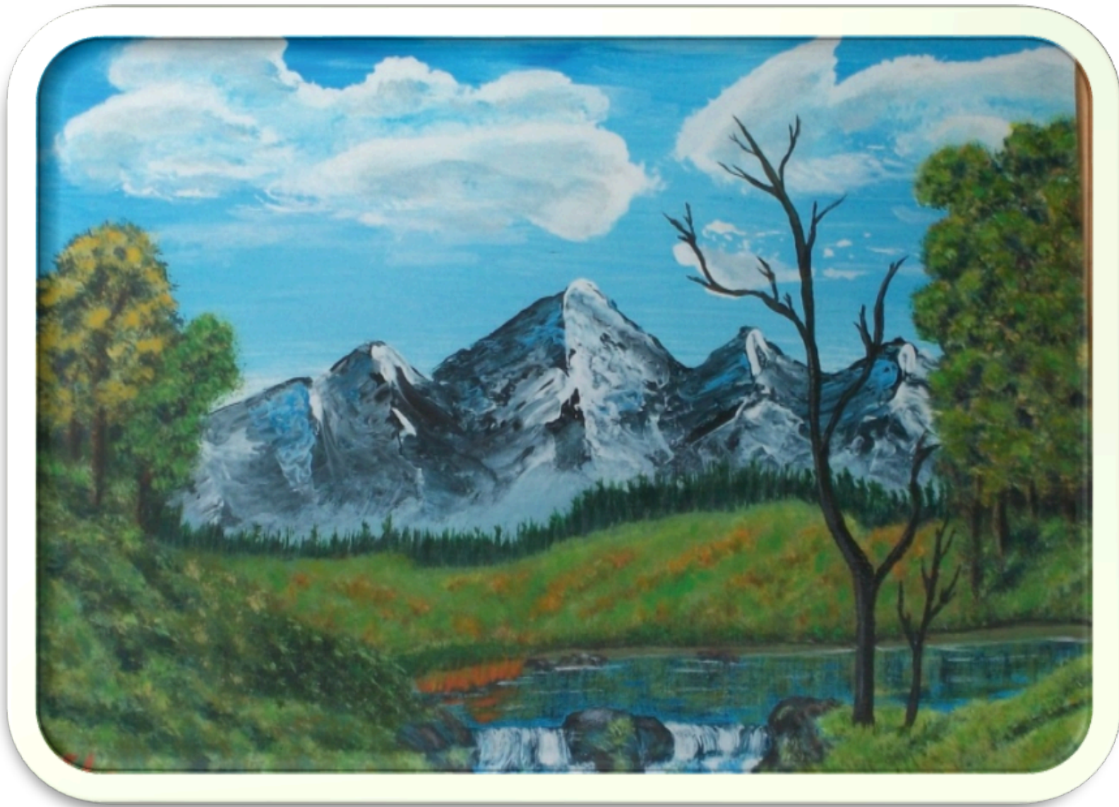
Mountain View. Oil, painting by PEL.

The Echo is flown, by our humble little sparrow Through the gorges and gaps, in our sunny White Alps, so narrow.