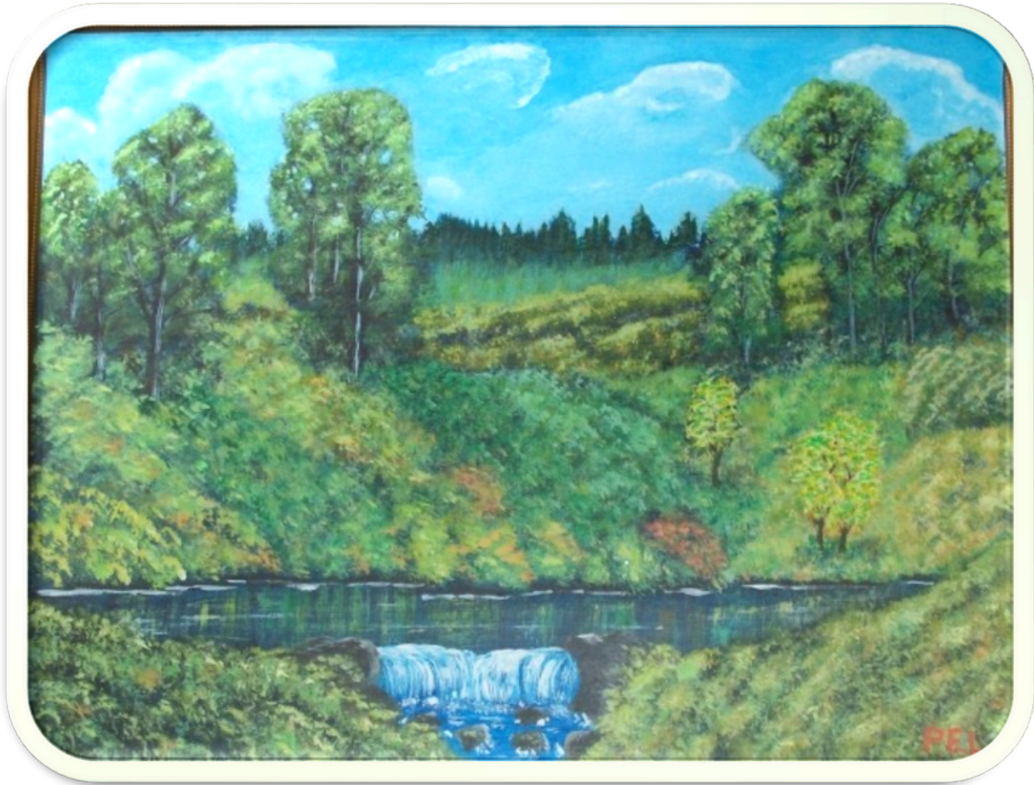
Nature's Bounty. Oil painting by PEL

Our wild Land of Birds and Beauty, Once a paradise for Colour and tribal people.