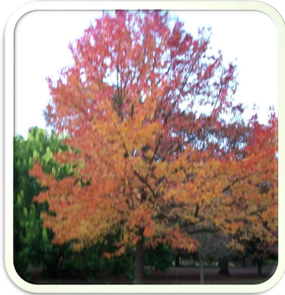
Nature's Cycles. (Gunnensbury Park, London.)