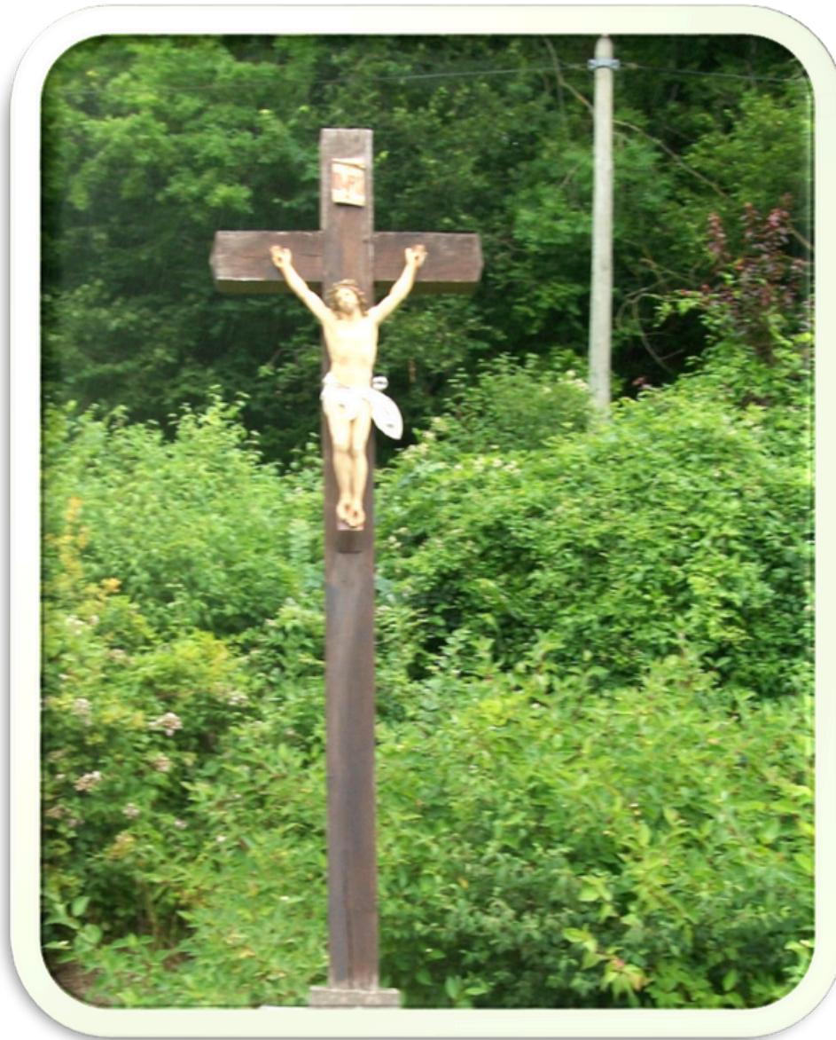
Jesus. (Calvados, France.)

And where we made Jesus our Holy Boss, But we never really brought Him down from His torture and His Cross