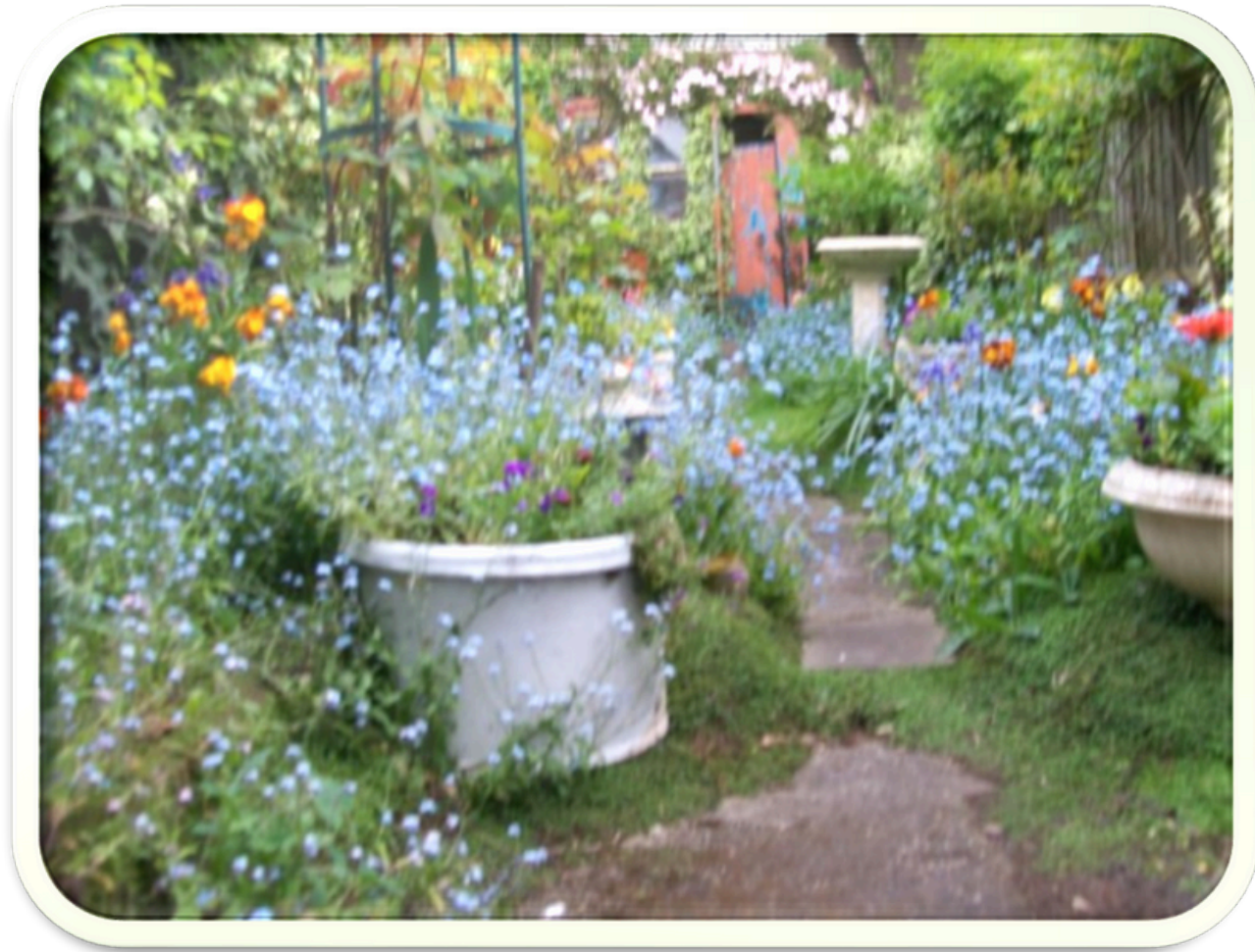
Forget-Us-Not. (London)