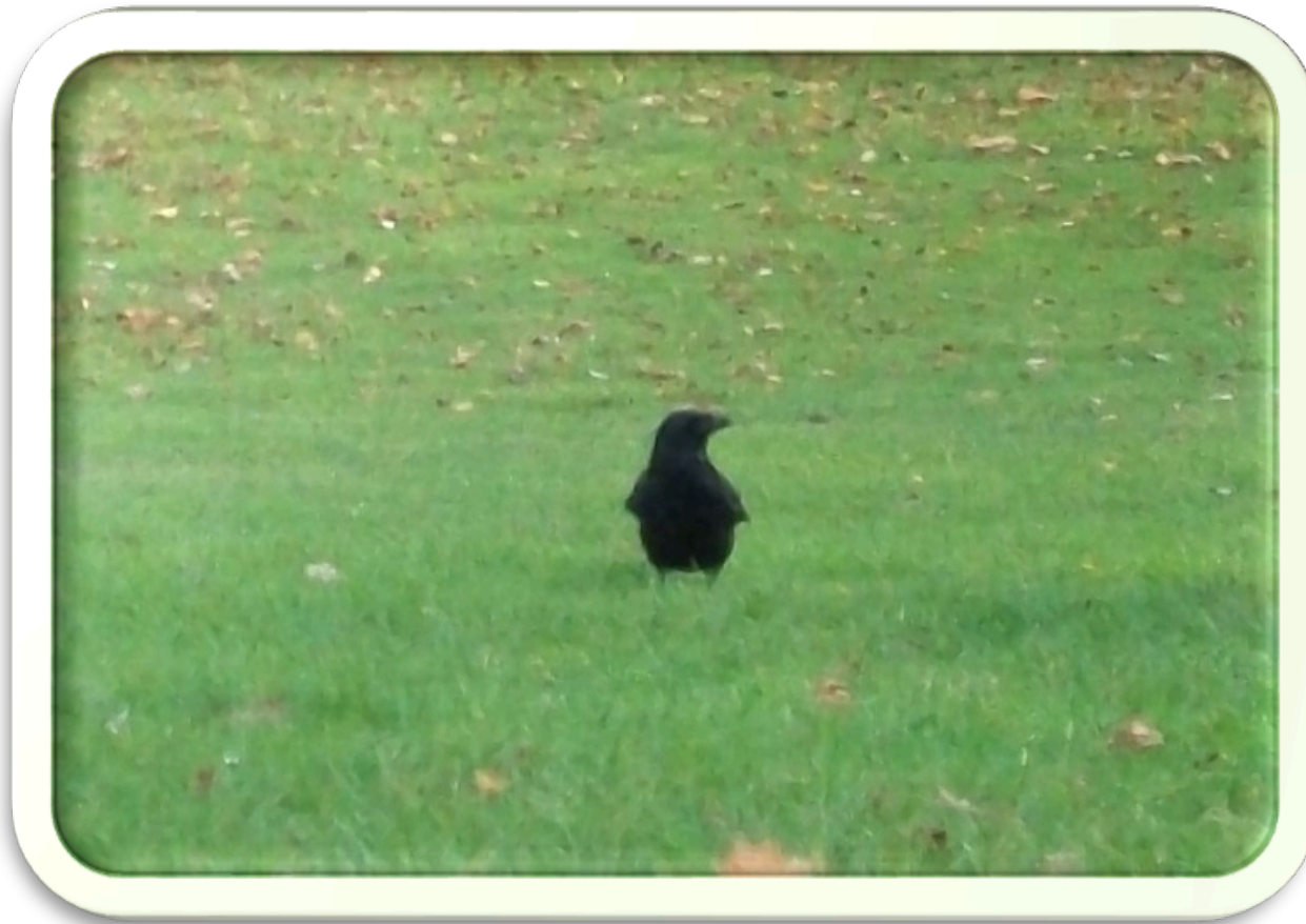
Black Bird. Gunnersbury Park. London.

We're so fed up with our own pollution, It's time for our gentle revolution"