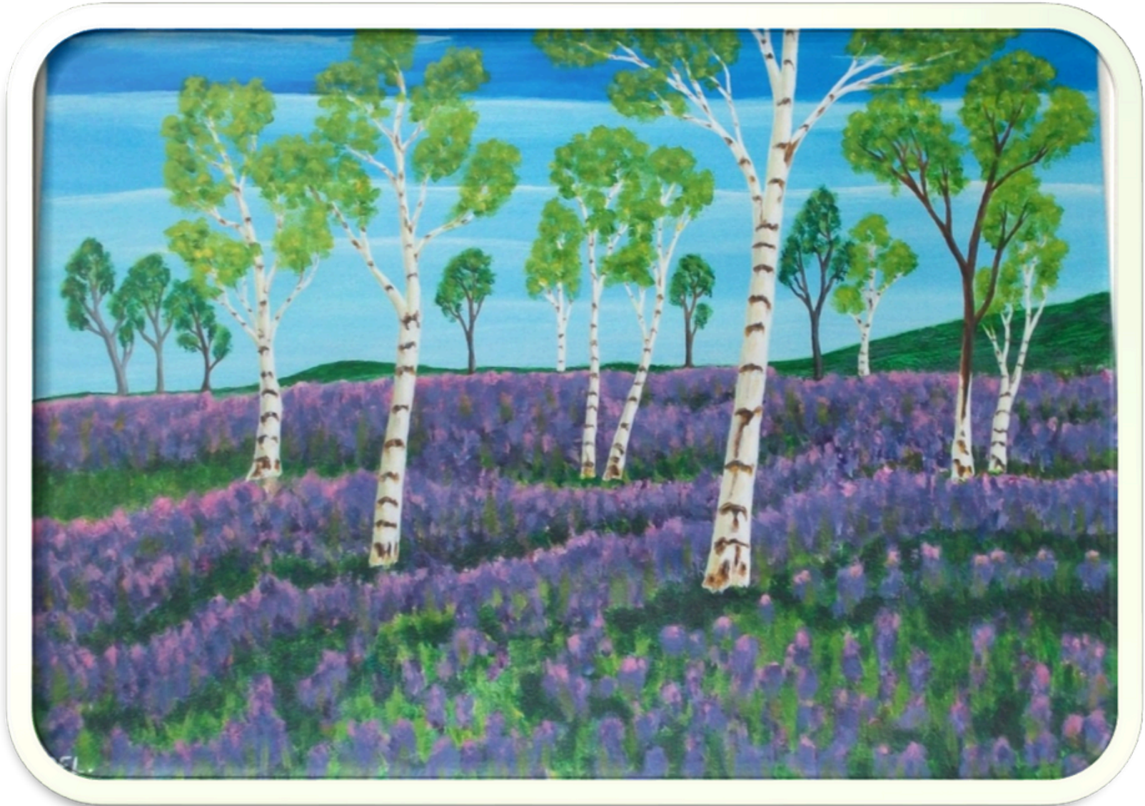
White Trees Of Birch. Acrylic, painting by PEL.

Let's create our dreams in our Garden of Colours, Surrounded by our beautiful White Trees of Birch Inside our wonderful and holy Earth Church.