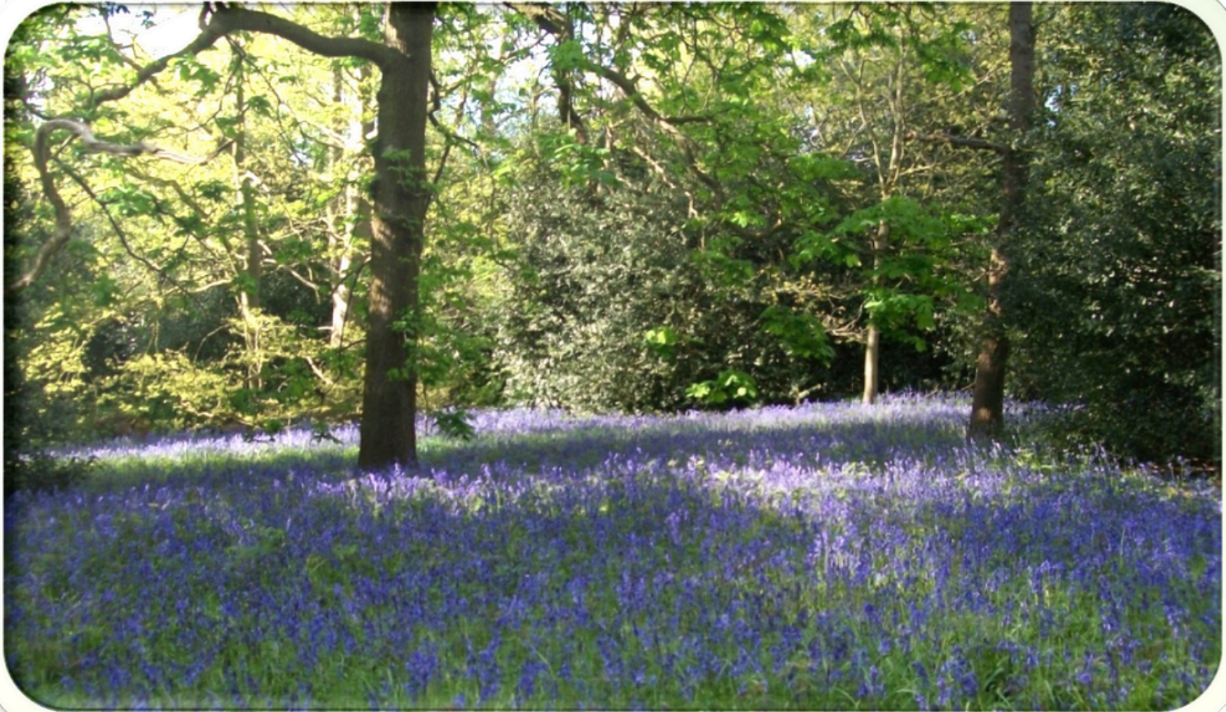
Bluebells. (Kew Gardens, London)

And our poem to, which has been dedicated to the millions of things Of beauty, on this sad and joyful journey, we have missed And for the things of beauty, we still haven't kissed.