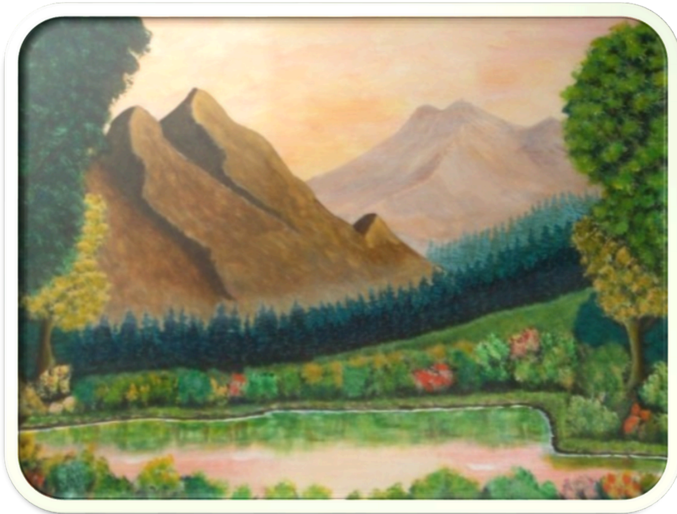
Mountain Lake. Acrylic. Painting by PEL.