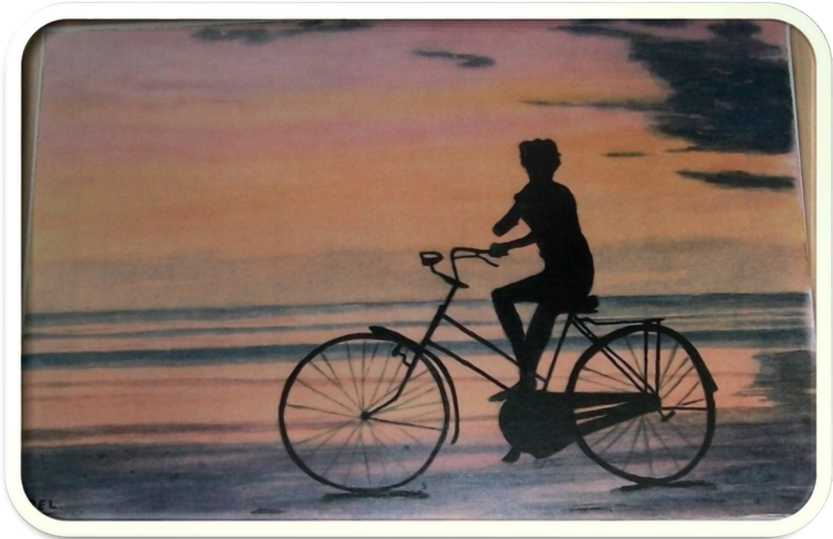
Boy On A Bicycle In Bali. (Pantai Kubu/Kubu Beach, Bali, Indonesia.) Acrylic, painting by PEL.

Now the Echo, tinged with a lovely golden hue is carried To the mystical and magical Land of Bali. An island in the sun, where the life they lead is holy.