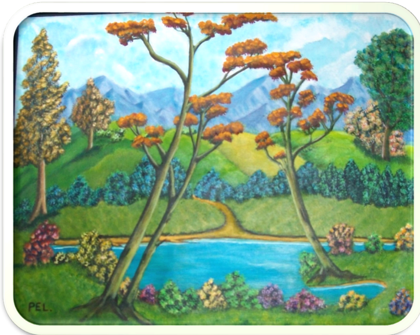
Tranquil Pond. Acrylic painting by PEL.

The Echo is blown across the Seven Seas and through the clouds in the sky And to the fish, the birds, the animals and the trees, While the Land plays the band.