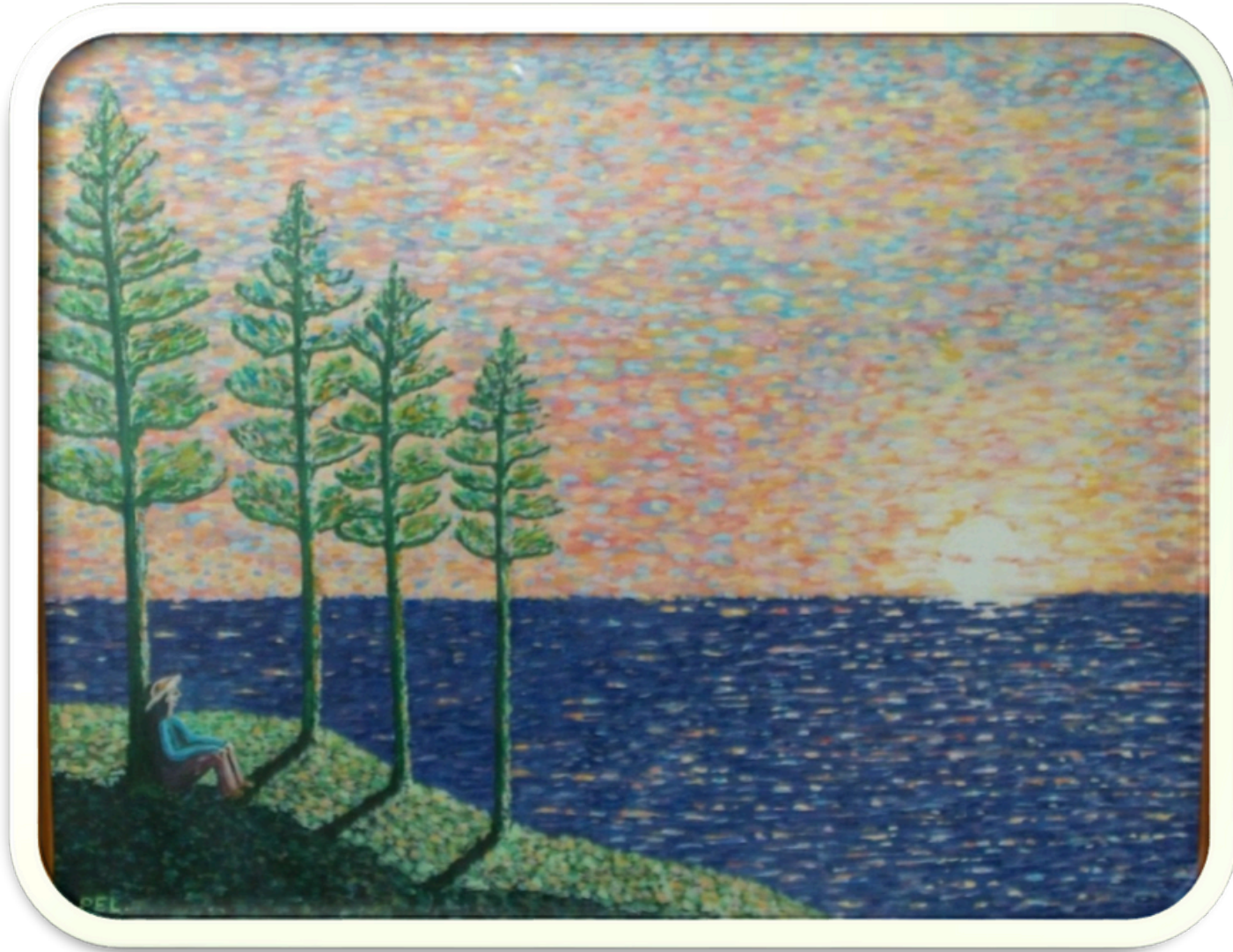
The Dawn Of The Aquarian Age. Acrylic. Painting by PEL.

Resting in the shade Of a fine looking tree Leaving behind all this wonder Is quite sad.