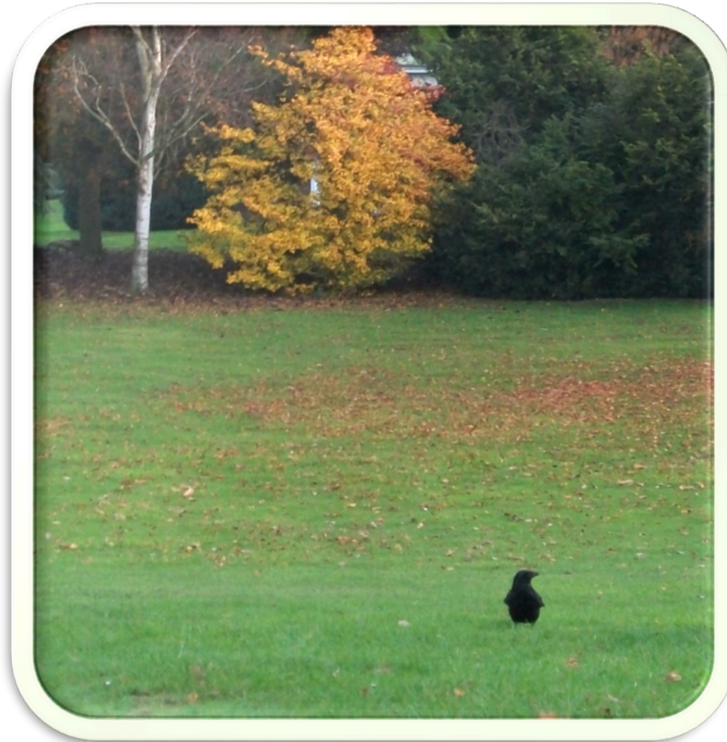
Black bird. (Gunnensbury Park, London)

“We have taken care to use kind and thoughtful words We listened to our trees and we listened to our birds.”