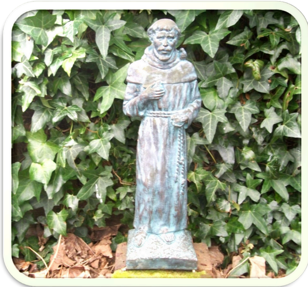
Saint Francis Of Assisi. (London)

The Echo now pauses to smile and dances With the Echo of the message, left by St. Francis.