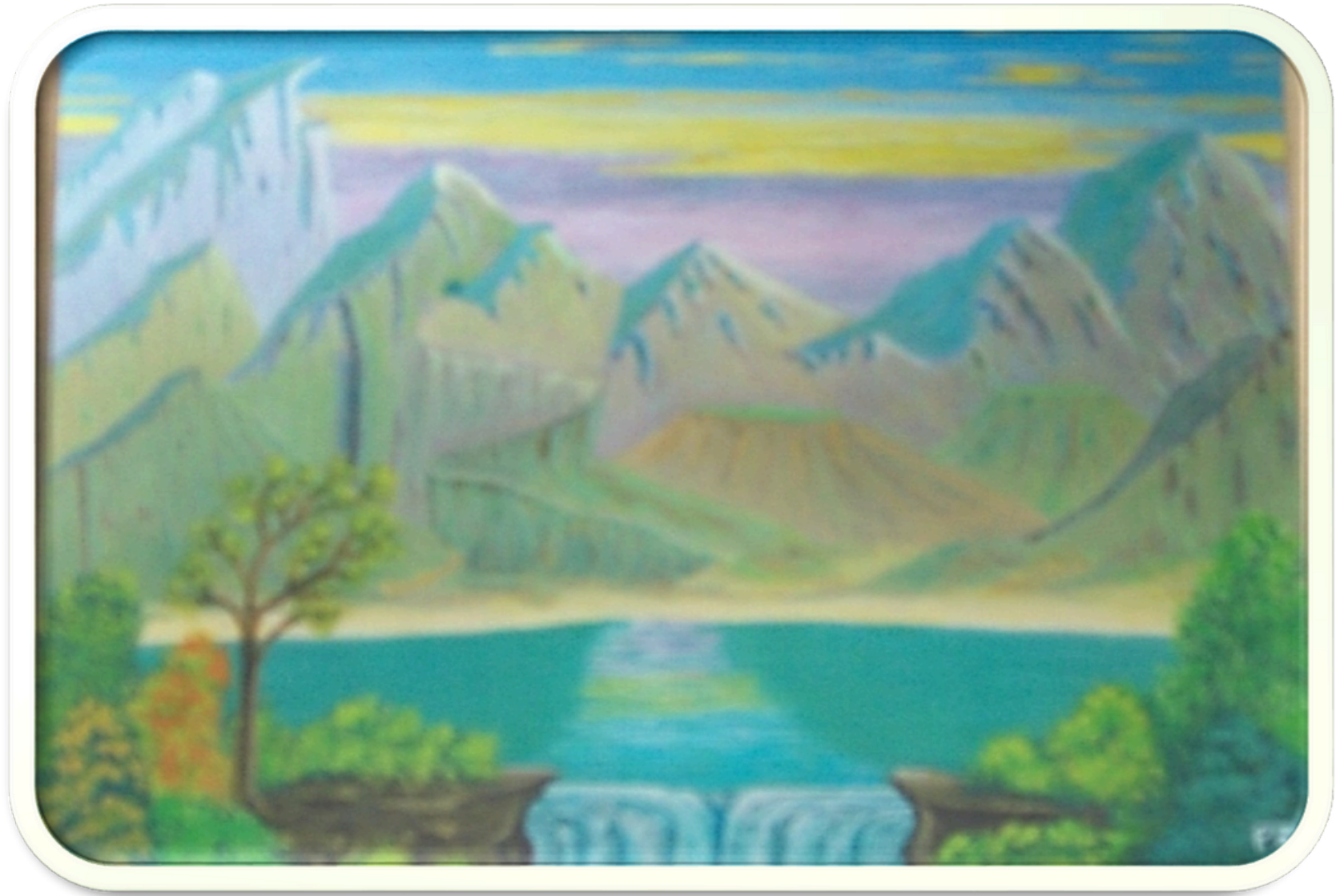
A Land Beyond. Acrylic, painting by PEL.

All happy creatures are in Heaven And even the unhappy ones will eventually get here, When they give up their doubt and let go their fear.