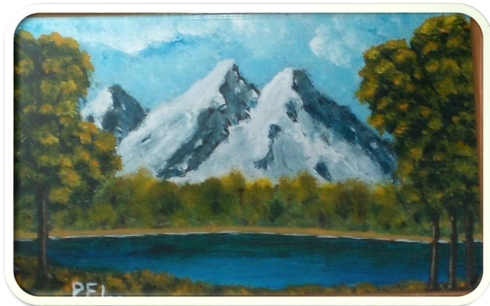
Snowy Mountains. Oil, painting by PEL.

Now our majestic and wise White Eagle takes the suffering Echo And flies it over our melting snow-capped mountains.