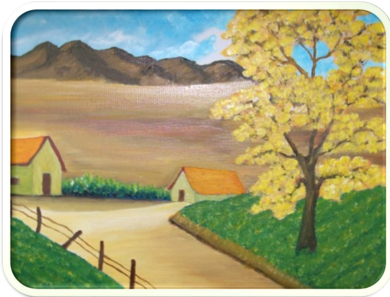
Country Road. Oil. Painting by PEL.