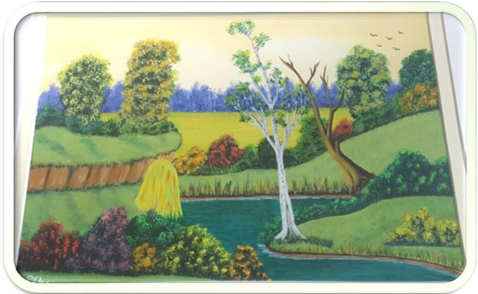
Nature's Serenity. Acrylic. Painting by PEL.