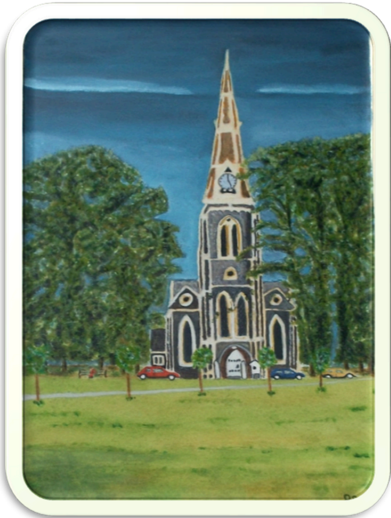
Christ Church Turnham Green. (London) Acrylic, painting by PEL.

Now the words are echoed by the peal of church bells. As they pass through the broken Roman Wall.