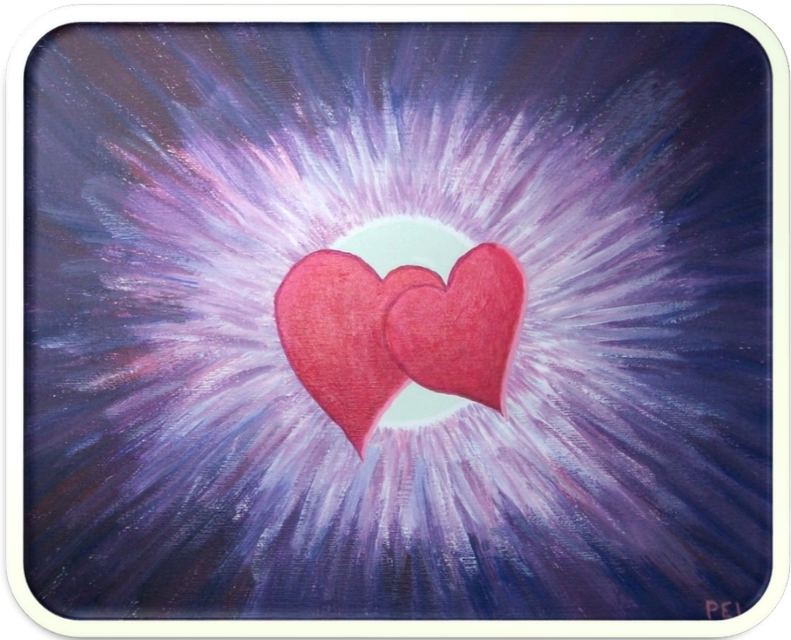
Brother/Sisterhood. Acrylic painting by PEL.

Unconditional Brotherly/Sisterly love will always diminish and fade our fears.