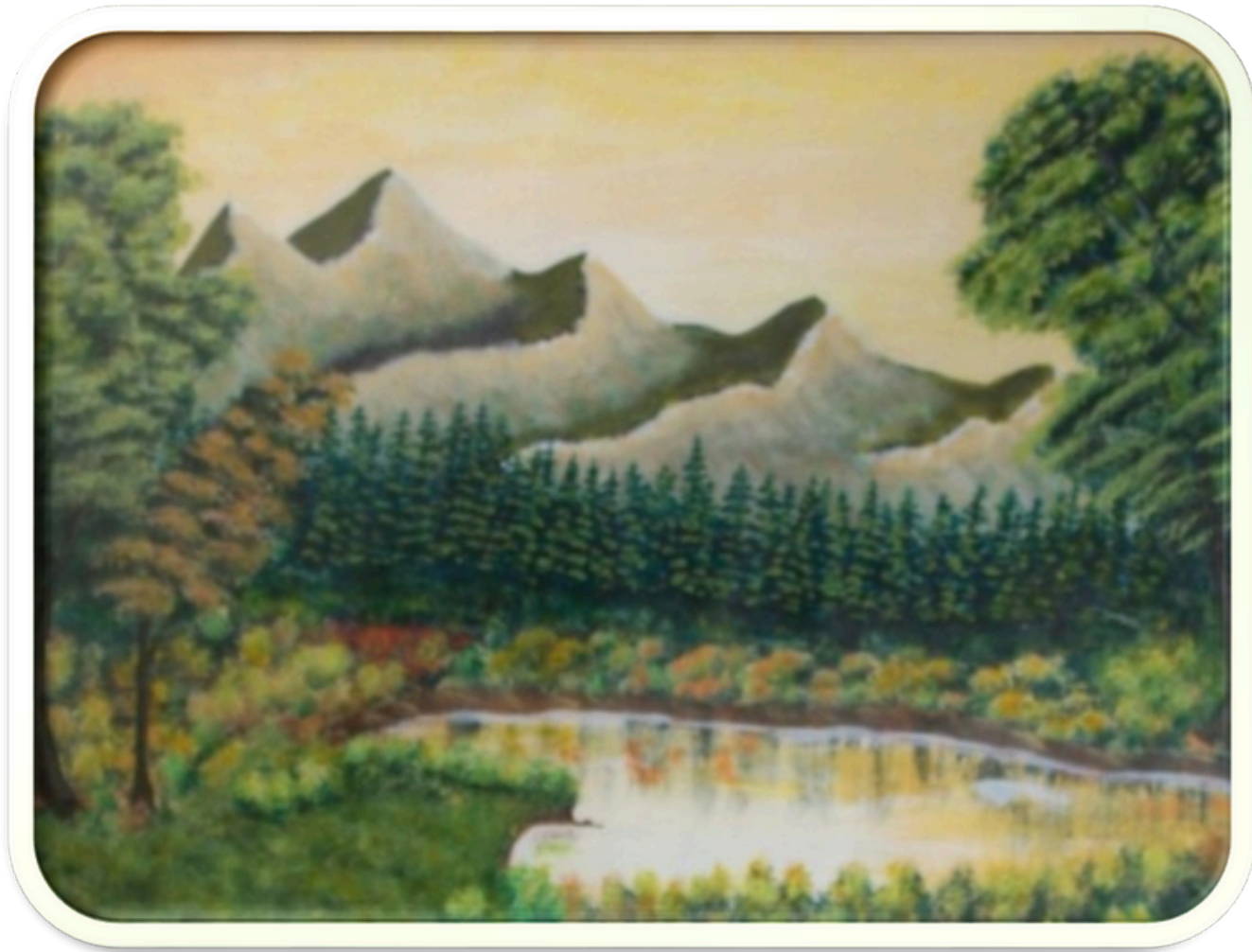
Mountain Pool. Acrylic, painting by PEL.