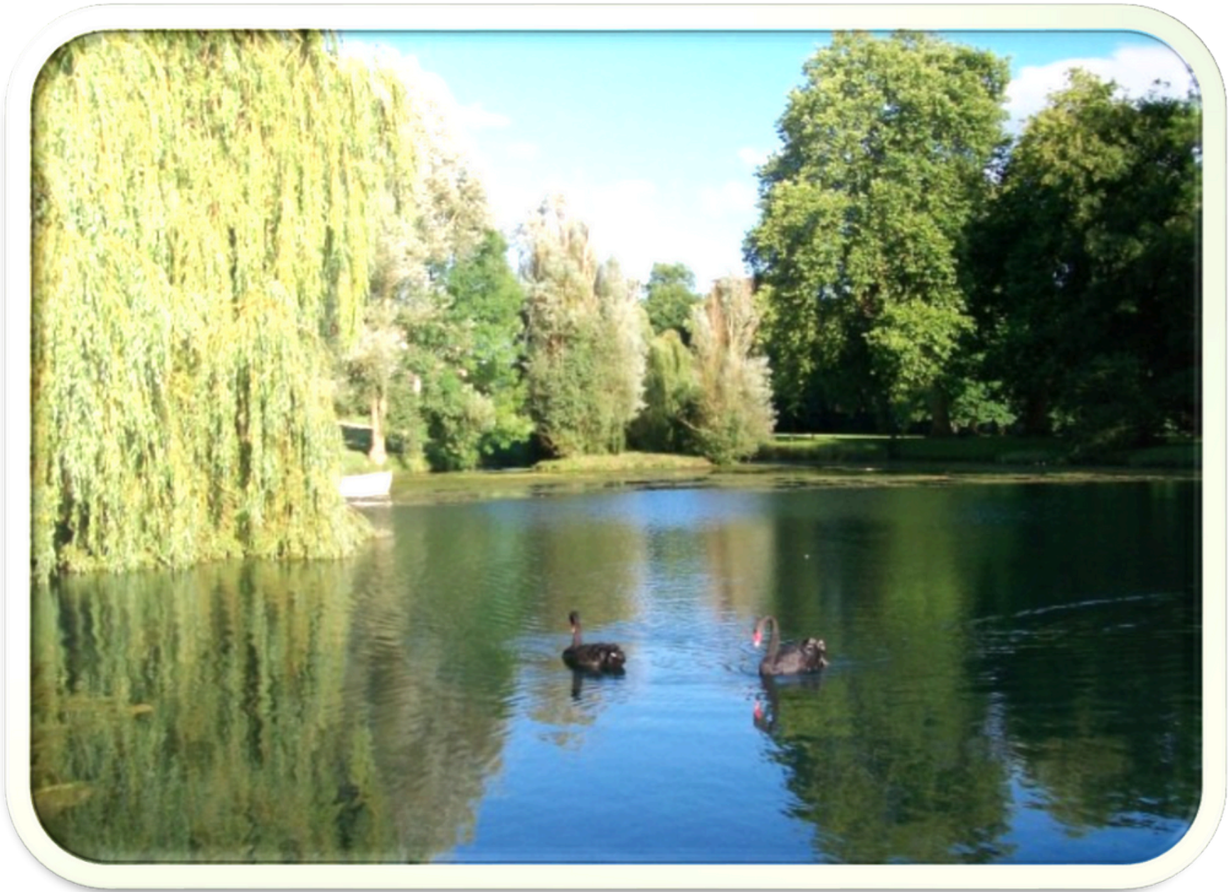
Nature's Beauty. (France.)