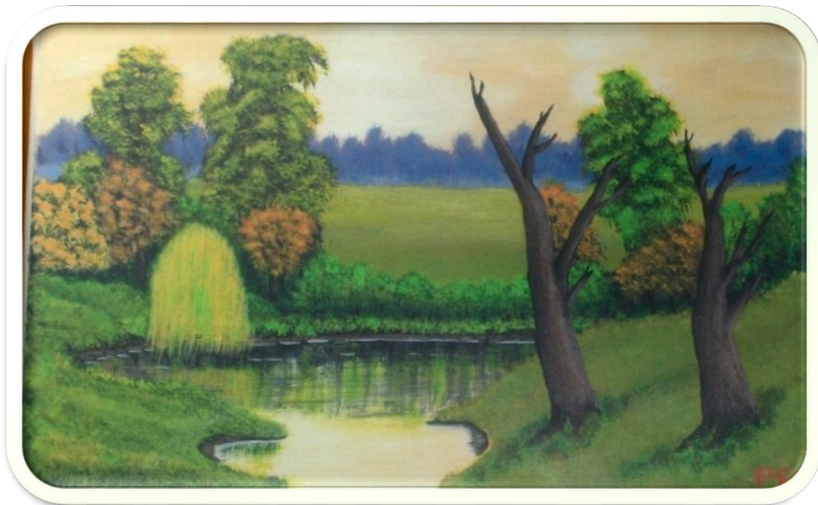
Willow Pond. Acrylic, painting by PEL. Our strange green Land of Leprechauns, Where Love and Peace has always been The Little People's questioning, artistic quest.