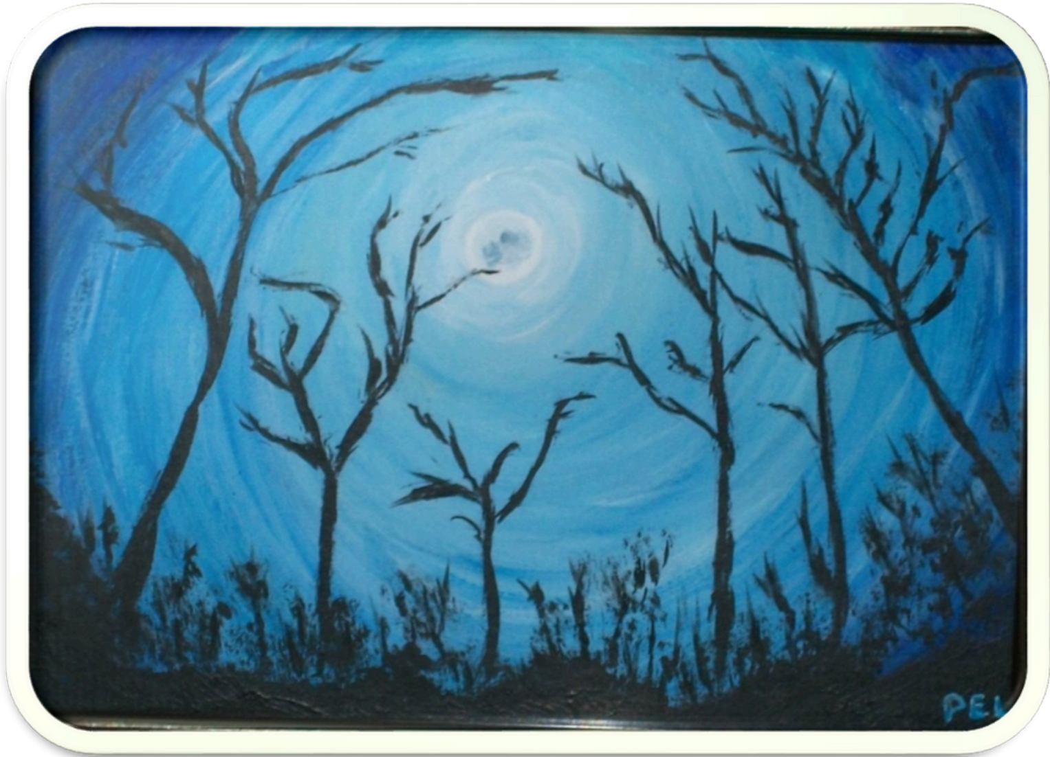
Wild Moon. Acrylic, painting by PEL

The demon, devil dogs by man they were named. They ran with the Moon and remained untamed.