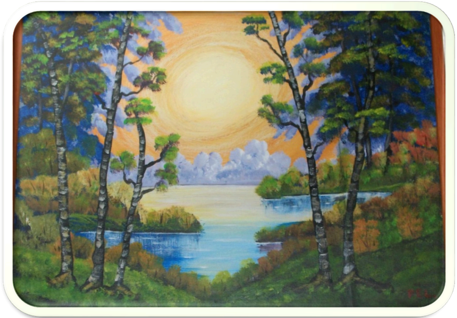
Nature's Magic. Oil, painting by PEL.

Now sounding crystal clear, the Echo goes dancing with our illusive butterflies To bless the sunny, happy Lands of Portugal and Spain.