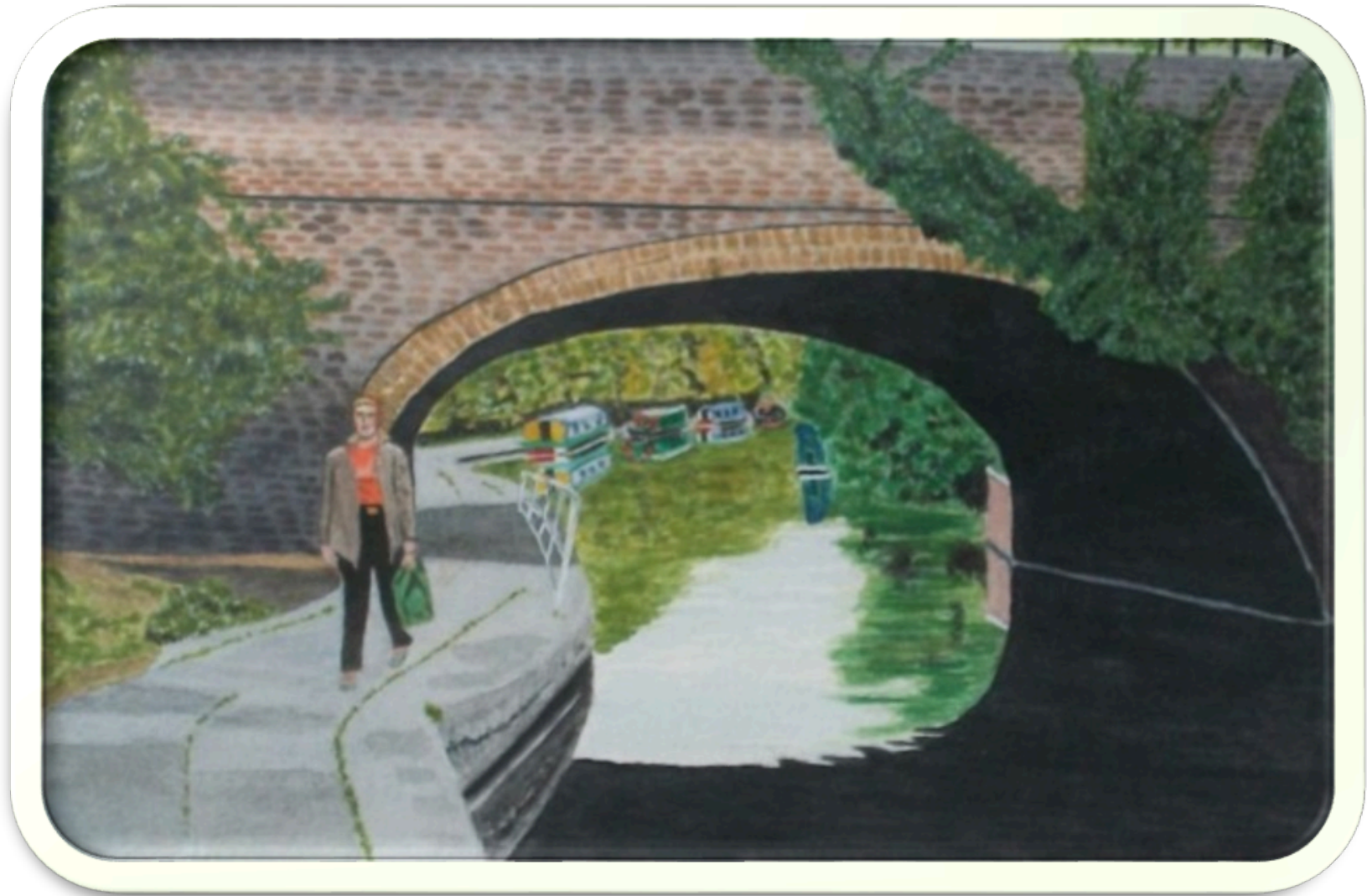
Regent's Canal, Camden Market. (London) Acrylic, painting by PEL.

Now the Echo, stalling for a moment, Blesses the crowded market halls.