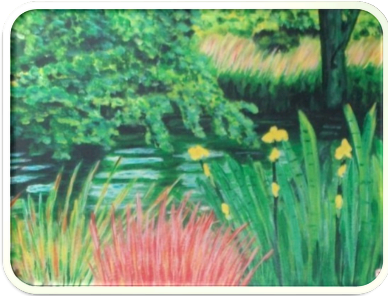
Iris Pond. (Orbec, France). Acrylic. Painting by PEL.